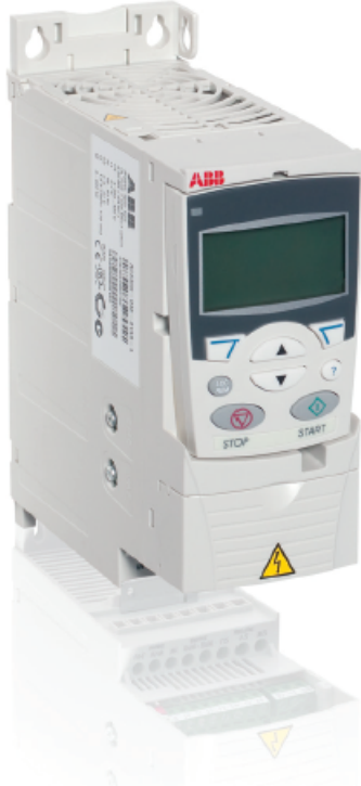
ABB VFD ACS355, IP20 20HP

Horse Power 20 | Full Load Amps 31 | Enclosure IP20 | Input Volts 380-480 | Advanced Panel