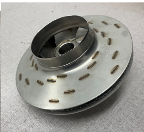
Goulds Stamped Impeller, 5-29/32"