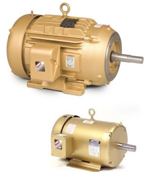
Baldor Reliance Motor, 3 Phase, 3600PM, 7.5HP, Footed Motor, Frame 184JM