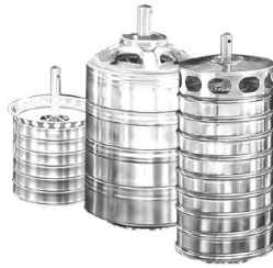
Grundfos 304SS Stack Kit for a CR 1S-2 & CRI 1S-2