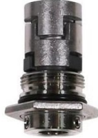
Grundfos 316SS Stack Kit for a CRN 1-17