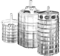
Grundfos 316SS Stack Kit for a CRN 1-27

www.pfcstore.com - 763-425-7890 / 800-328-2350