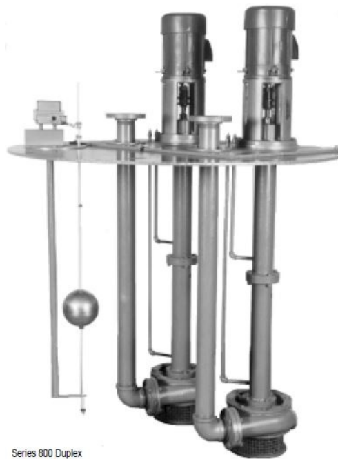
Series 800 Duplex