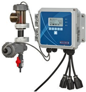
Walchem W100 Controller for Cooling Towers & Boilers